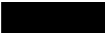
Black Absorptivity 0.95 - VW16068 Gauge 26, 24