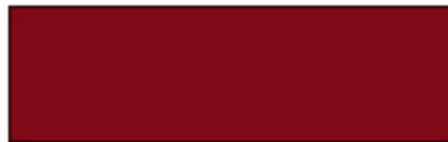
Bright Red Absorptivity 0.67 - VW16080 Gauge 26, 24