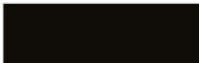
*LSR Dark Brown Absorptivity 0.94 - QC15039 Gauge 26