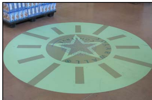
The SolarWall star, located in a main aisle of the store.

Wal-Mart decided to actively showcase the energy-saving features with information screens throughout the stores, and a "walk of fame". Each energy technology involved in the process has a "star" in the store which describes their technology, and how it will reduce energy consumption and improve the working environment. The objective is to increase awareness and allow customers to learn about the different technologies, thereby mainstreaming the concept of energy efficiency.